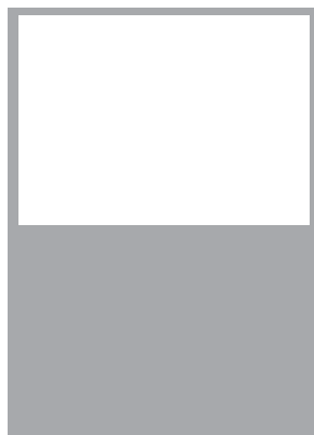
1/2 Page: $400