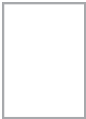
Full Page: $750