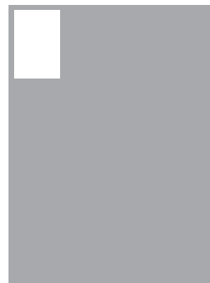
Bus Card Page: $150